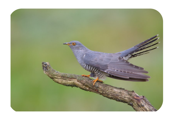
Common Cuckoo

Since my article in the last Village News, I have been asked all sorts of questions about "birds". It is very difficult to impart knowledge gathered over a lifetime but the first thing I learnt was that I should try and identify the call, then one can look in a Bird Guide for the bird, provided you know what family it belongs to. It is useful to know the size compared to a bird you do know, then whether it is a duck, goose, falcon, gull, wader, corvid, bunting, passerine, hirundine or warbler etc, and the habitat you saw it in. If you are close enough and can get a picture that would be good. I am always willing to help if someone has seen something 'different'. If I can, I shall try to come to the site right away.