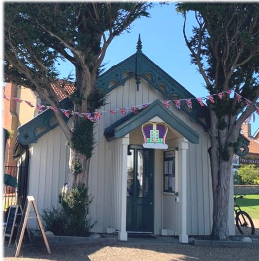
The Heritage Hut on Coronation Day