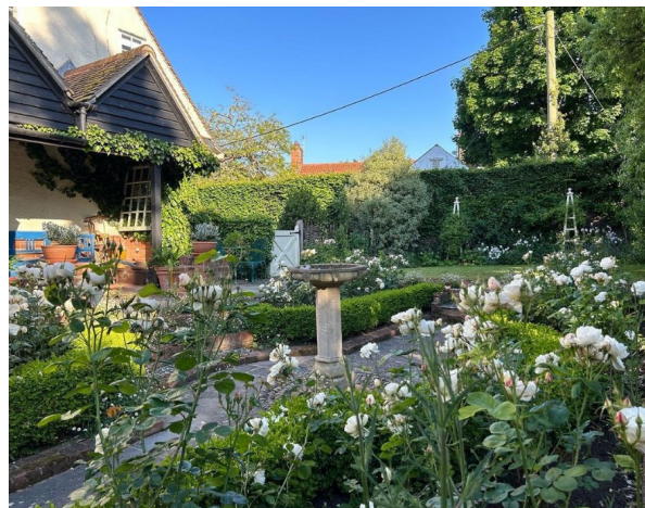
Walberswick Open Garden.

Thank you also for last year's donations to the Fete plant stall . Your wonderful collections of succulents went down a storm, plus stunning exotics, cut flowers, coastal plants, allotment produce and houseplants. Anything garden related and in good condition would again be much appreciated. Please contact either Diana Wright at dianawright26@btinternet.com or Helen Riches at riches90@ntlworld.com closer to fete day.