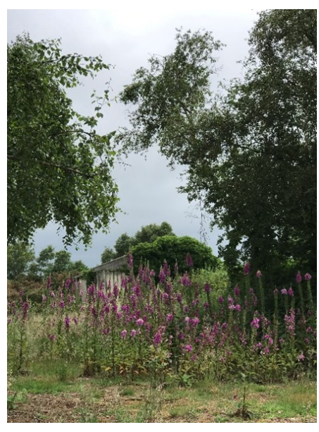
Foxgloves flourishing by the old pavilion

The 2019 countryside stewardship agreement with Natural England continues until the end of 2023 and extends to about 70 hectares of the Charity's land. The annual payments under the agreement average around £21,000. The funding is for, amongst other things, the management of lowland heathland, reedbeds and wet grassland for wintering warders & wildfowl as well as for bracken control. The management of lowland heathland expressly requires the Charity "to provide a mosaic of vegetation which allows all heathland features to flourish, including pioneer heath and bare ground which benefits rarer invertebrates, birds, reptiles and plants."