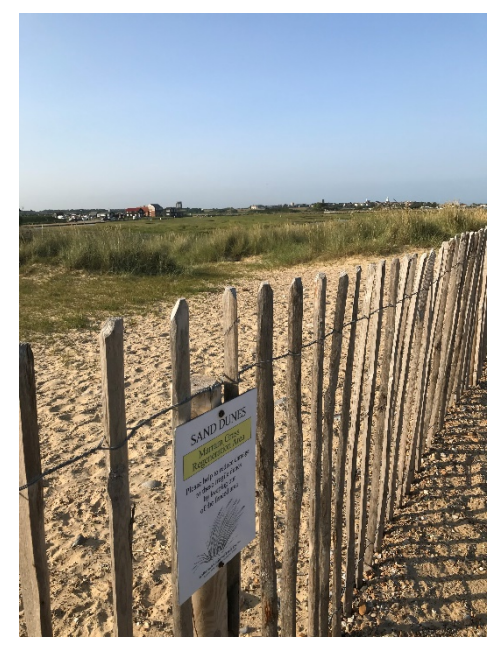
Marram grass regeneration on the sand dunes

The new planting included some 800 hedge whips as well as oak, wild plum, crab apple, rowan, field maple beech and Scots pine, a few of which were transplanted from the Common. Although the new trees will take some years to mature, they are a key part of the long-term management of the landscape for future generations.