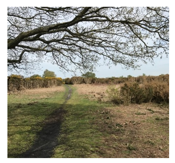
Birch and gorse cleared from Compartments 8 & 10

Gorse which had been smothering the heather and encroaching on the footpath between compartments 1 and 2 was cleared back. The southern end of the footpath between compartments 10 and 11 was also cleared, together with gorse along the boundary with the sheep field, adjacent to the path to the side of the firebreak north of the playing field, as well as gorse in the railway siding.